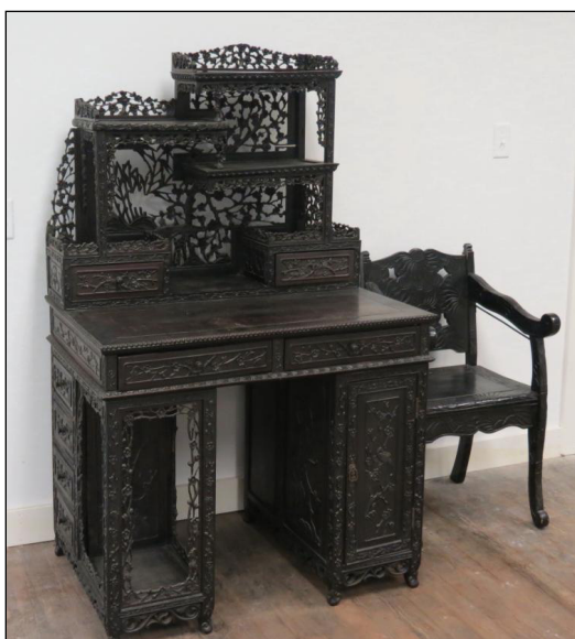
One of the bargains of the evening was a heavily carved Chinese ebony desk, with a chair. It went for $345.