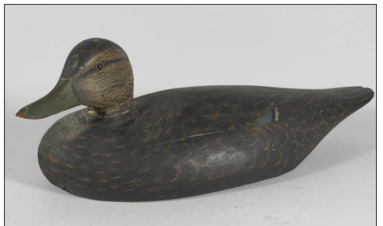
In original paint, a black duck by Elmer Crowell, branded with an oval stamp, sold for $1,955.