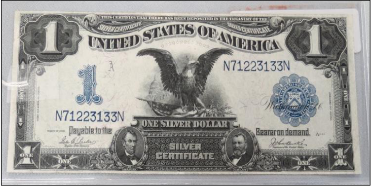
The sale included several pieces of American currency. This large $1 "blanket" note, circa 1899, went for $633. It had engraved portraits of Lincoln and Grant.