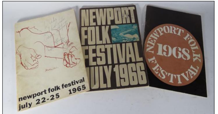
Programs from three Newport Folk Festivals, 1965, 1966 and 1968, were autographed by performers, including Joni Mitchell. Each contained at least 44 pages and the group of three realized $230.