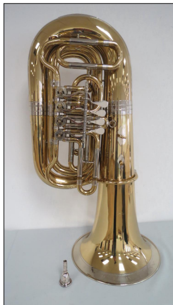
The sale included several Twentieth Century band instruments. This Miraphone brass tuba, with original case, reached $2,645.