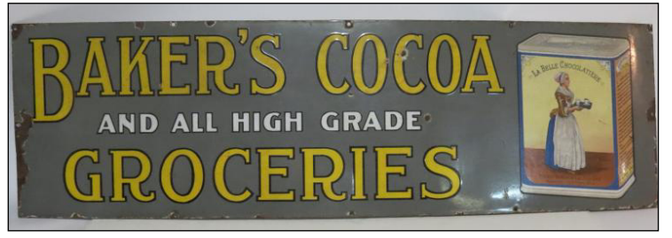
A Nineteenth Century Baker's cocoa enameled sign, 46 inches long, brought $1,265.