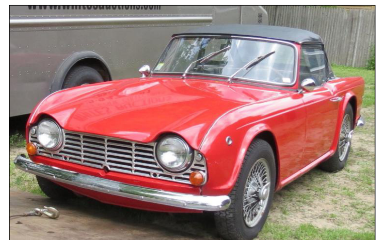
Parked in front of the auction building, this 1964 Triumph TR4 convertible created a lot of interest. It was bright red, with a black leather interior and 64,000 original miles. A buyer in the back of the room paid $8,913 for it.