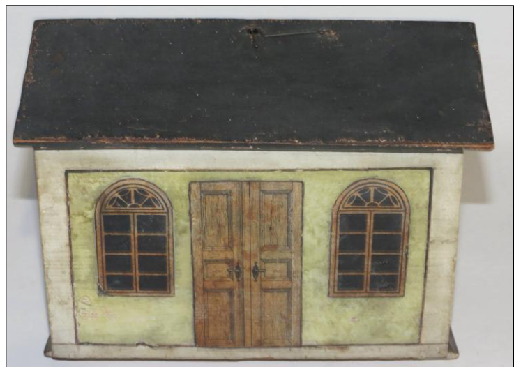
The folksy painted wood, German one-room schoolhouse came with 15 carved and painted composition figures and it went out at $2,990.