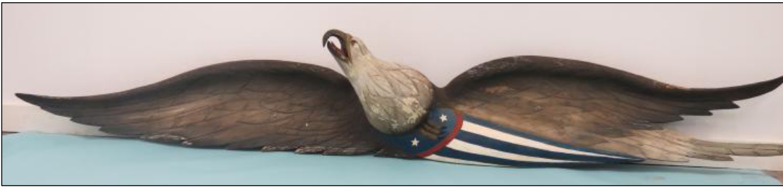
The top grossing lot of the sale was this well carved stern board, more than 10 feet long. It came from Kingston, Mass., and sold for 11 times its estimate, finishing at $10,350.