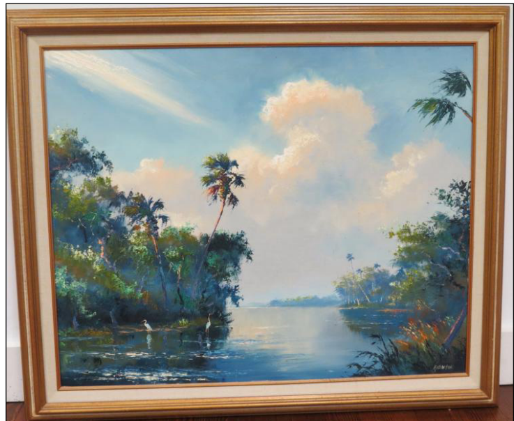
The Florida Highwaymen were a group of self-taught African American artists, working in the Sunshine State. Harold Newton was, perhaps, the best painter of the group and this landscape may have been a good buy, bringing $2,760.