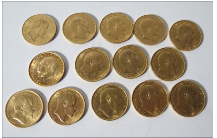
Fourteen Edward VII gold sovereigns, dated between 1904 and 1925, brought $4,945 from a bidder in the room.