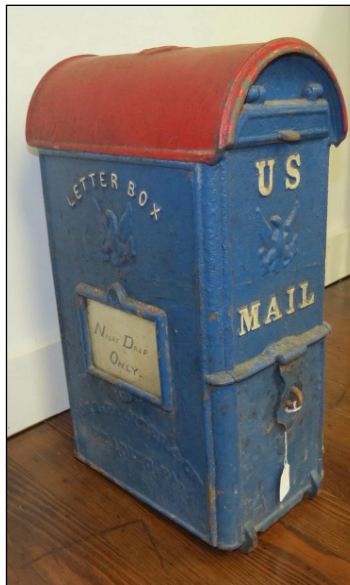
Even the auctioneer was surprised when this circa 1880-1900 cast iron mailbox, made in Carlisle, Penn., sold for $1,438. It had an embossed eagle and raised lettering that read "US Mail."