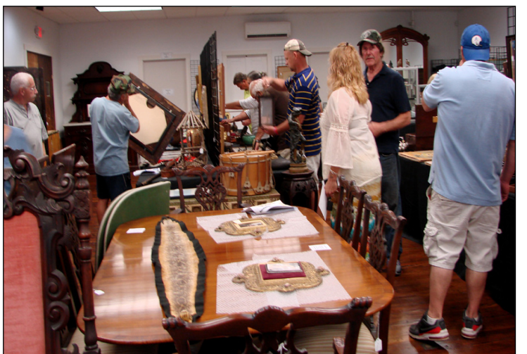
Numerous buyers examine merchandise prior to the auction.